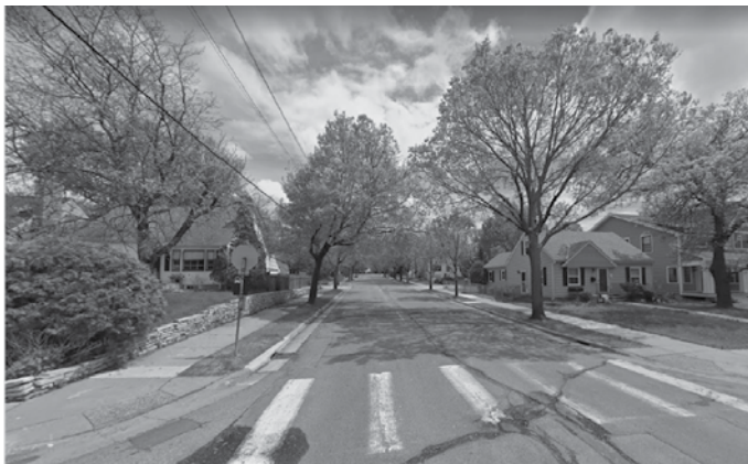
58th Street West at Emerson Avenue