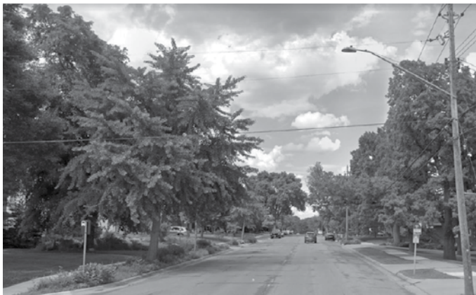
Sunrise Drive at 58th Street West